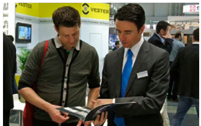
We will be happy to send you product literature on our measuring machines upon request. Contact us at: info@Klingelberg.com .