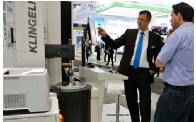
Technical experts from Klingelberg present innovative measuring technology in a "hands-on" demonstration on exhibited machines.