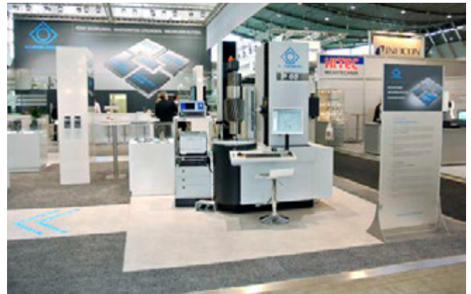
Presentation of "Gear measurement," one of the five segments at the center of this year's Control fair.